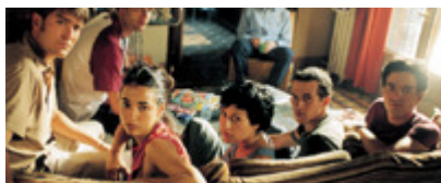
Pot Luck www.cinefile.co.uk/