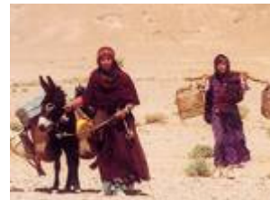
Keltoum's Daughter www.cinefile.co.uk/