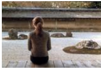
Fear and Trembling www.cinefile.co.uk