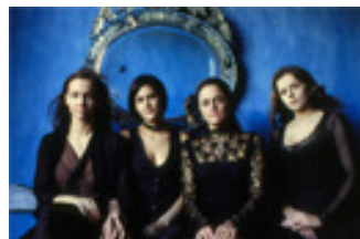
The Three Marias www.cinefile.co.uk