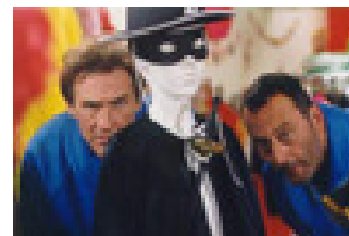
Tais Toi! www.cinefile.co.uk/