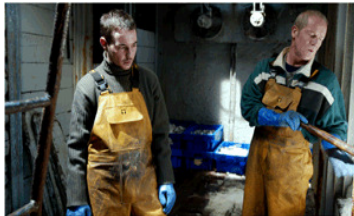
True North www.truenorth-film.com