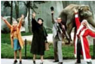
Block Booking Scheme/French Collection: Le Père Noël est une ordure

On behalf of the BFFS team we wish you all a very pleasant winter break.